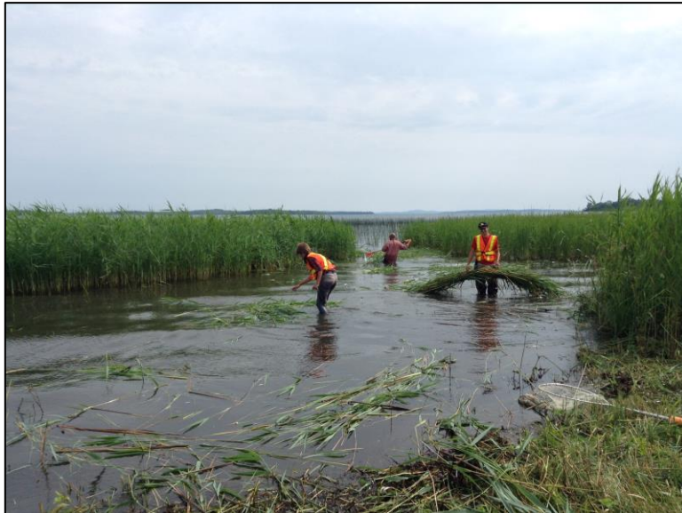
The Phragmites Team at Sheguiandah FN pow wow grounds in 2017. This year, the Phragmites cut here filled less than one garbage bag.

We need to arrange a steward for every control site so that if Phragmites pops up again or gets out of control, someone will be ready to take care of it. We also want to make sure Phragmites awareness does not dwindle, so we will continue showing people about control on their own land. And we still have more control to do in turtle habitats and wetlands. We are aiming for region-wide control at the end of 2022. It is do-able!