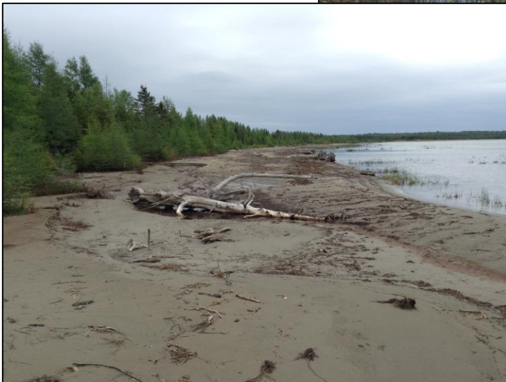
Left: Michael's Bay, 2018 after control