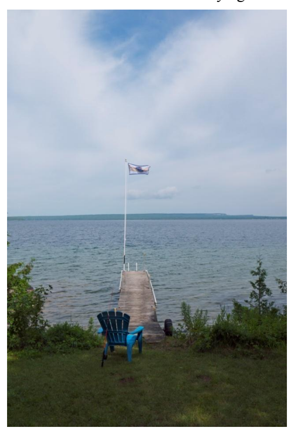
LMAA President's Cottage on Frank's Road

In late summer a call was put out to members to send in pictures of their LMAA Flags flying at their cottage. The "flag" is the most recent addition to the LMAA apparel line available for purchase by members. In total, 25 members purchased flags. These are the pictures we received. In the March issue of "Windswept" members will be solicited again to see if enough exists among members to place a second order of flags. Hopefully next summer more will be noticed flying around the lake!